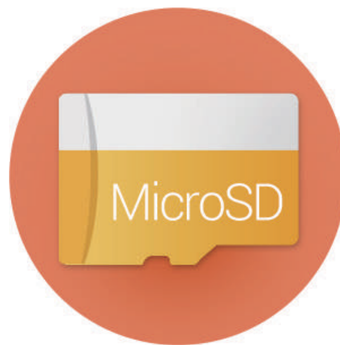
Supports MicroSD Card

Save your recordings with flexible and secured solutions. The DB1 comes with a built-in MicroSD card slot that can store up to 128 GB of recorded footage. You can also save your images to EZVIZ Cloud for additional back-up. (The EZVIZ CloudPlay is only available in the US, UK and Europe)