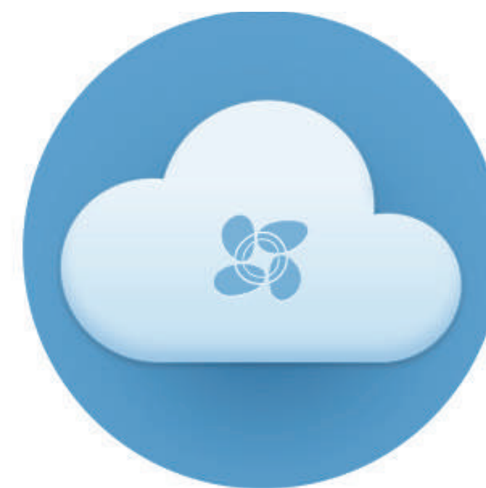
Encrypted Cloud Storage