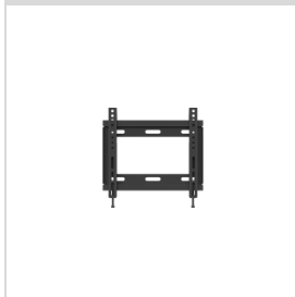
DS-DM1940W Wall-mounted Bracket