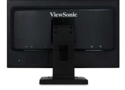
TN 1920 x 1080 PANEL RESOLUTION