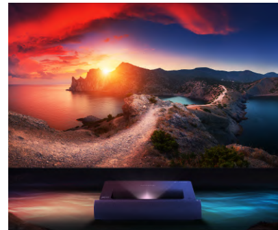
TRUE 4K LASER PROJECTOR WITH HDR CONTENT SUPPORT